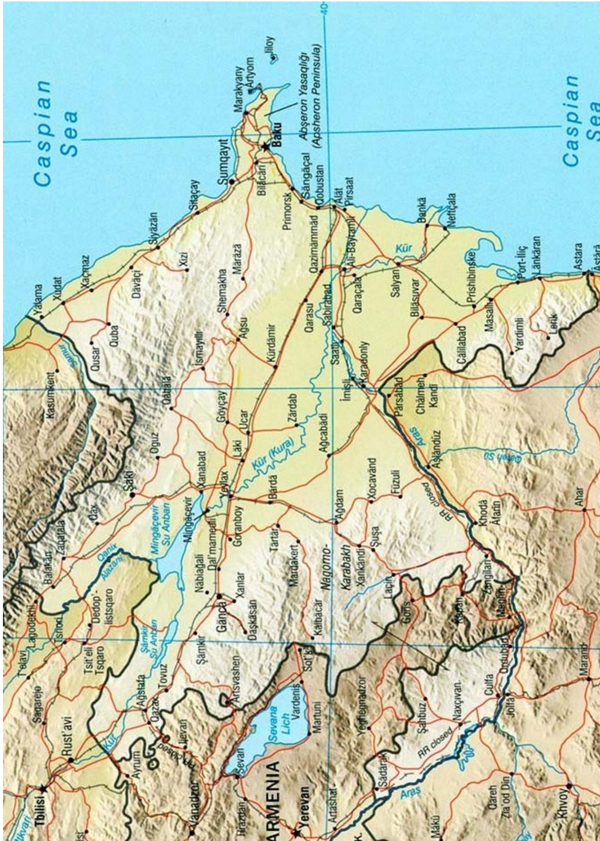
Figure 2: Topographic Map of Azerbaijan