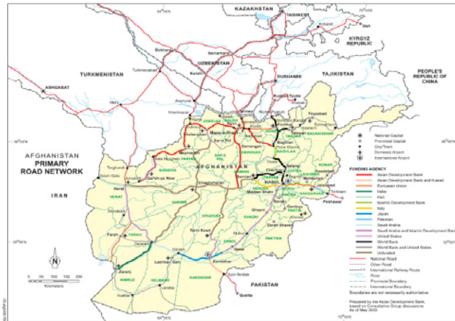
Figure 2: Afghanistan Primary Road Network 11

The above development would offer a large number of options for private transport through Afghanistan. For example, as many as fourteen routes connect Tajikistan and Pakistan via Kabul to the exit point at Torkham. Other entry/exit points allow for seven routes linking Uzbekistan and Pakistan and five between Uzbekistan and Iran. In addition, ten routes connect Tajikistan to Iran via various alternatives in Afghanistan and six alternative routes between Turkmenistan and Pakistan, along with ten routes connecting Turkmenistan and Iran all via Afghanistan.