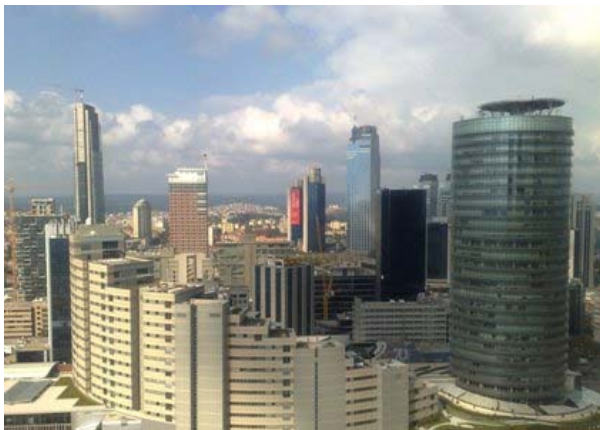
Istanbul's population has grown from 2.1 million people in the 1970s to over 12 million today.

economies are usually more flexible and able to produce more internationally competitive products simply because of the advantage of targeting both domestic and international markets. Fourth, Turkey with its young workforce has a better economic perspective against the background of the rapidly aging population in the European Union. The shift in demographics in Europe will probably lead to an important geo-economic change taking place. According to some economic predictions, there will be a significant decline in domestic consumption and in economic growth across the EU in the coming decades, making it necessary for the countries of the European Union to turn to the Turkish market for growth by outsourcing some of their industrial production, development of care industries and a number of other services.