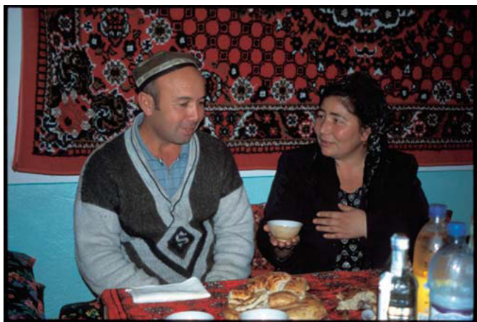
Strong family ties underpin Central Asia's rich and diverse culture.

The key to economic and social renewal in Central Asia lies in expanding regional and continental trade.