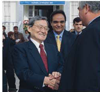
ADB President Tadao Chino (left) greets a guest at the Tajikistan Resident Mission's inauguration

Central Asia is a region of difficult challenges and vast opportunities. The Asian Development Bank (ADB) works with Central Asian governments to help them reduce poverty and to serve as an integral link between large and dynamic markets in Europe and Asia. “Regional cooperation is not an option but a necessity for Central Asia,” said ADB President Tadao Chino in an interview. Excerpts: