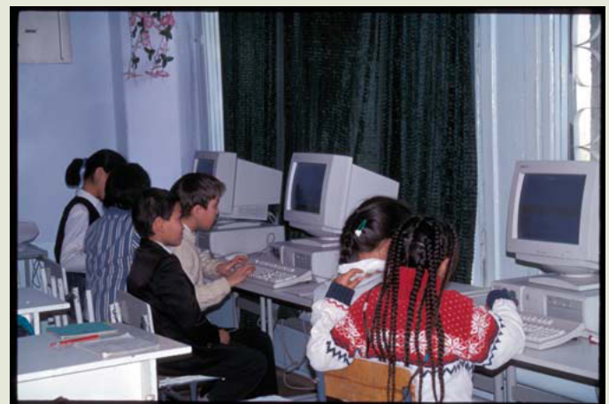
Basic education, a building block for sustainable development, is universal in the region.

The strength of Central Asia's human resource base requires qualification in two areas. The expansion of the market economy threatens to decimate the ranks of teachers and university professors, as higher wages and new opportunities of the emerging private sector lure them into businesses and abroad. The second concern involves the continuing short supply of workers with practical modern skills. Millions of older men and women must be retrained if they are to compete successfully with professionals in other modern economies and benefit from the global division of labor. Appro-