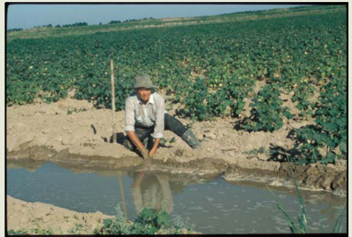
With its fertile land, Central Asia is a major world cotton producer.

Any fair enumeration of the region's assets must give pride of place to its human resources. In